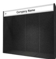
Booth 1 Fascia Sign & 3 Walls