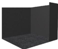
Walling & Carpet Only Side Wall & Back Wall (no fascia signs)