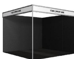
Booth 2 Fascia Signs & 2 Walls